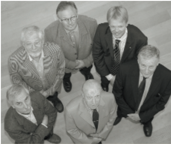
The Directors' Committee of the ETUI-REHS: (from left bottom corner, moving clockwise)

Through its expertise, scientific publications, reviews and training programmes, the ETUI-REHS will provide European trade unions with the tools to participate in the European debate and to contribute actively to achieving Social Europe.